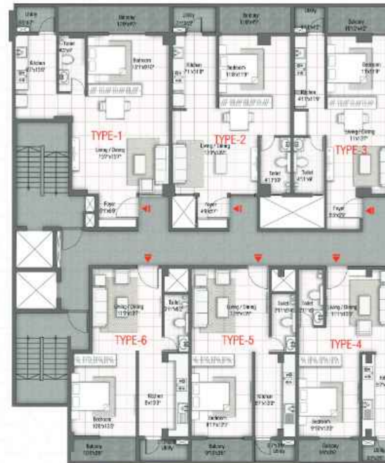
5 th Floor