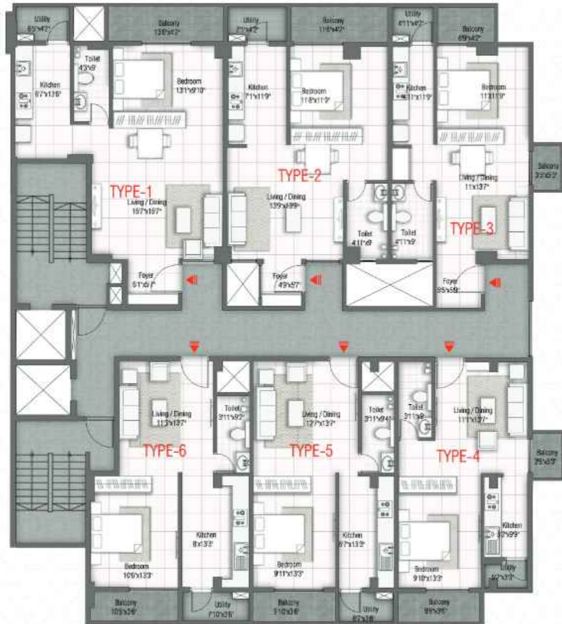
6 th -11 th Floor