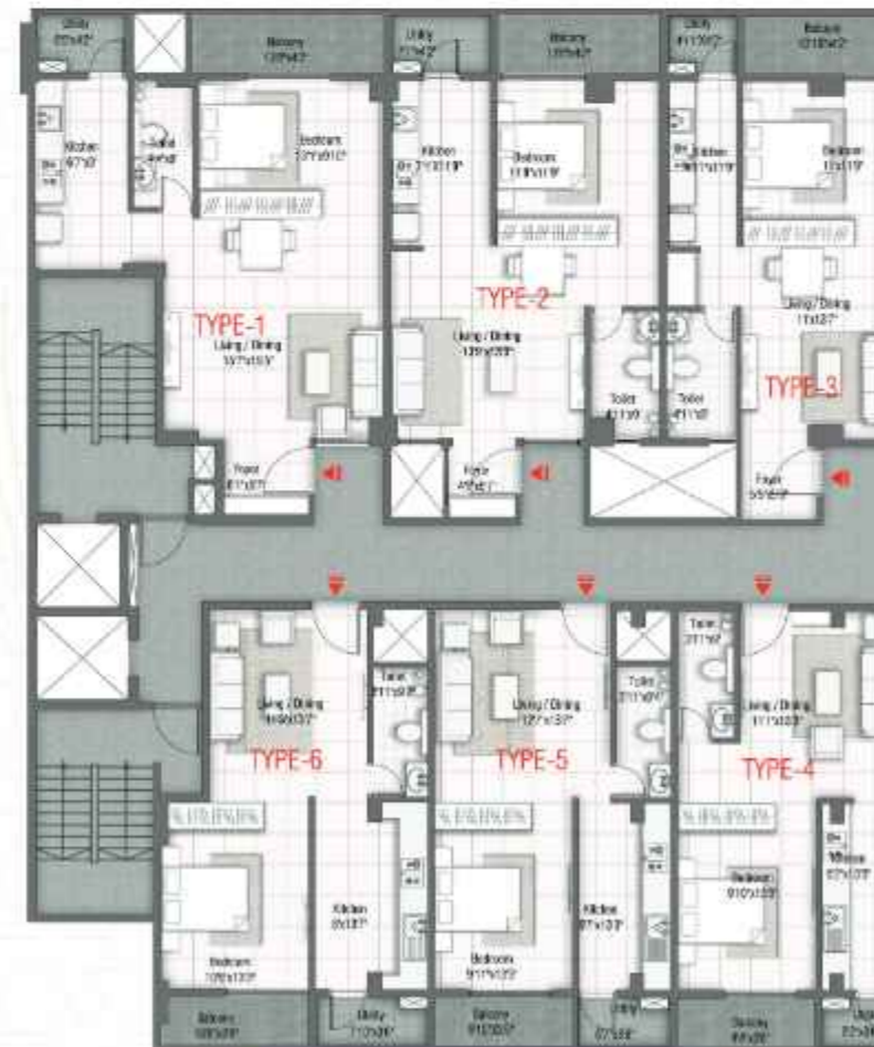
12 th Floor